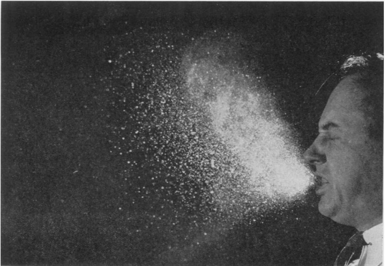
Fig 1 | Short range still imaging of stages of sneezing, revealing the liquid droplets from the 1942 Jennison experiment. 5 Reproduced with permission

Yet eight of the 10 studies in a recent systematic review showed horizontal projection of respiratory droplets beyond 2 m for particles up to 60 \mu\text{m} . 7 In one study, droplet spread was detected over 6-8 m (fig 2). 28 These results suggest that SARS-CoV-2 could spread beyond